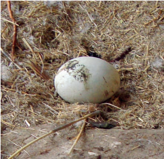
Plate 1. The single egg in a Himalayan Vulture Gyps himalayensis nest, 4 May 2013.

available throughout the grasslands. The nest construction can be seen in Plates 1, 2 & 3. Small objects such as coloured glass, small veterinary bottles, plastic items (e.g. cigarette lighter), pieces of bone and ceramics were found occasionally in the nests. Nests were built on ledges or in cavities and small caves on cliffs (Plates 4, 5 & 6). Outer diameter measured 90–320 cm, inner diameter 35–60 cm, centre depression 7–15 cm deep. We were very surprised by this unusual behaviour, whereby such a big bird used a large amount of small, soft, dry reed stalks to build a huge nest. We can only speculate about the means by which these small reeds were carried to the nest site—could they have been swallowed and then regurgitated at the site?