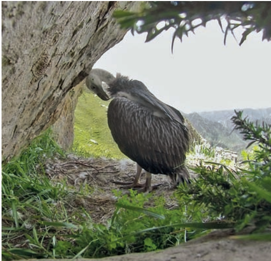
Plate 6. Well-developed juvenile preening, 15 July 2013.

Some nests contained branch tips of Spruce Picea schrenkiana or local bushes Caragana sp. presumably used for insulation purpose. These materials do not appear to have been used because of a shortage of suitable sticks from forest trees—the tree-line is at 1,700 to 2,500 m with many bushes and trees in the vicinity (Plate 7). Thus it appears that the materials were used from choice and the Himalayan Vultures in this area have developed unusual nest-building techniques.