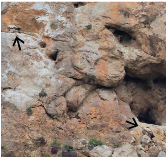
Plate 11. Typical Himalayan Vulture nesting colony using ledges, caves and crannies on steep rock face, 16 August 2012.

In the study area, other carrion eaters such as Cinereous Vulture Aegypius monachus , Griffon