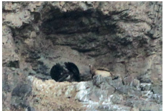
Plate 12. Juvenile and adult Himalayan Vultures at nest sites, 5 October 2013.