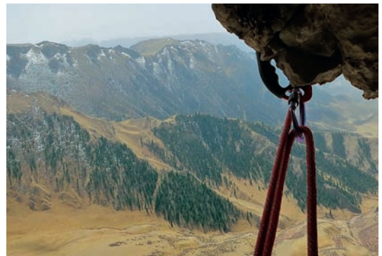
Plate 7. View from nest platform showing distant tree-line across the valley, 30 March 2013.