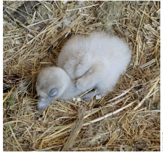
Plate 2. Recently hatched Himalayan Vulture chick on a nest, 31 March 2013.