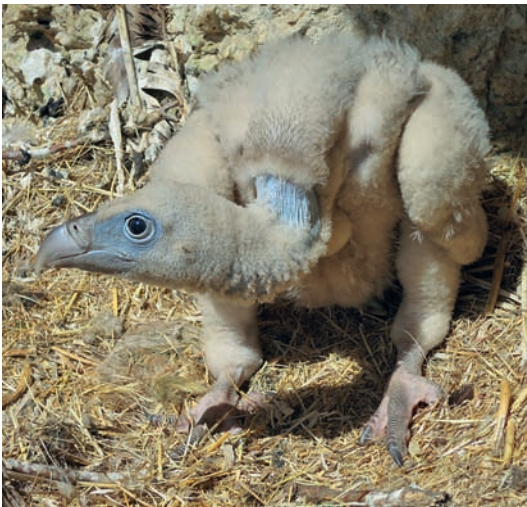
Plate 3. Developing juvenile still with downy coat, 15 July 2013.