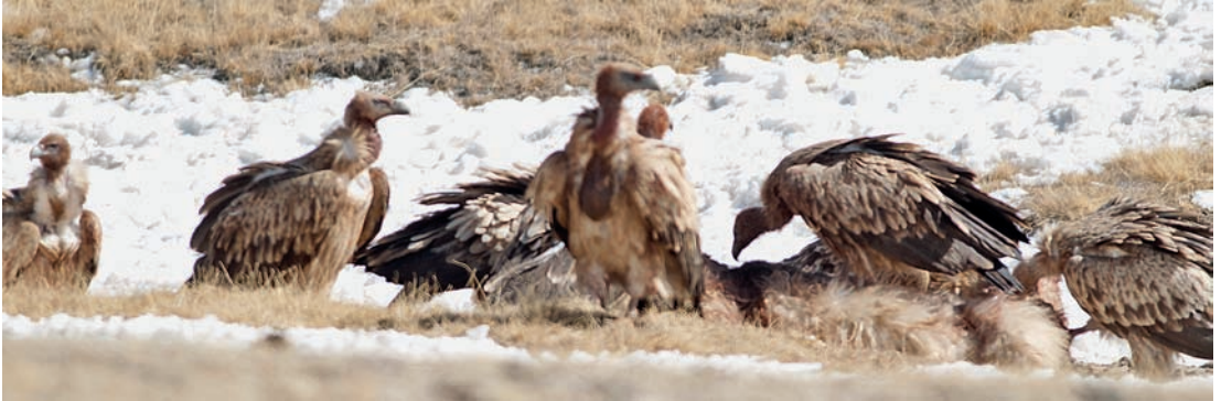
Plate 8. Himalayan Vultures feeding on carcass of a yak killed by wolves, 21 March 2013.