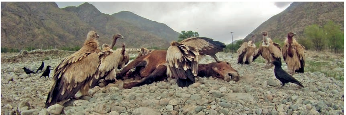
Plate 9. Himalayan Vultures feeding on a recently dead horse, 10 May 2013.

sharp increases in outdoor tourist activities, over-grazing, mining, poaching, rodent poisoning, etc. The area and quality of habitat used by wild ungulates is adversely affected, leading to a significant reduction in population of the wildlife that was the basic source of food for the vultures.