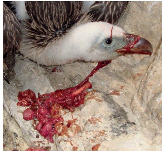
Plate 10. Juvenile Himalayan Vulture eating fresh meat at the nest, 27 May 2013.