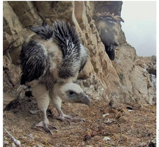
Plate 4. Two well-developed juvenile Himalayan Vultures on ledges, 4 May 2013.