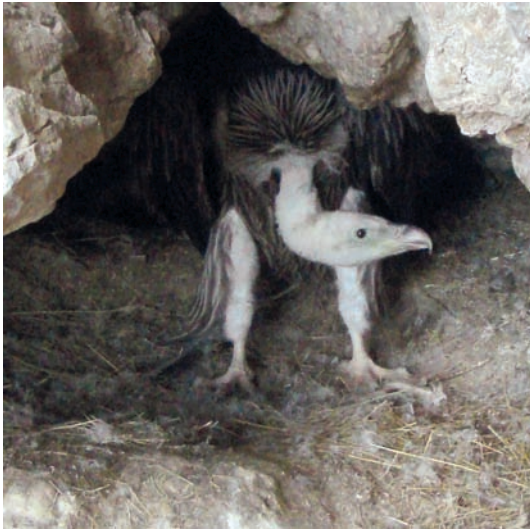
Plate 5. Well-developed juvenile in cave, 15 July 2013.